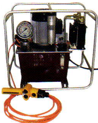
Shown with Heat Exchanger